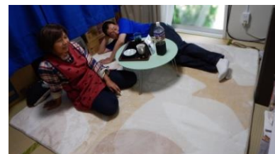
Room equipped with electric carpet