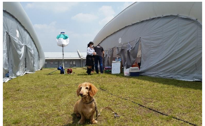
Women-only/pet-friendly balloon shelters

In the Mashiki Town Athletic Park, PWJ built two "balloon shelters," large inflatable tents, each of which had enough space to accommodate 50 people at one time. They were used especially for female evacuees and evacuees with pets who tended to shy away from moving into evacuation centers.