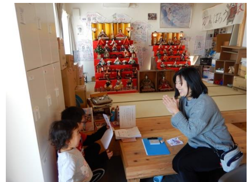
The Doll Festival ( Hinamatsuri ), the custom of displaying the hina dolls wearing brightly colored, traditional Japanese attire