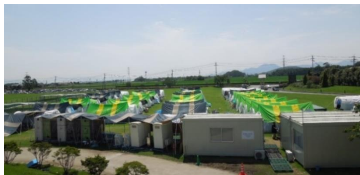
Evacuation tent camp in Saishunkan Hilltop

Due to increasing concerns about heatstroke caused by the summer heat, PWJ set up a unit house camp consisting of 80 prefabricated houses and 6 trailer houses as an alternative to the tent camps. Each room was about 10 square meters big and had air conditioning and refrigerator. The camp's facilities included a common room, a study room, 4 shower rooms, a laundry, 15 temporary lavatories, 2 washstands, a common kitchen, a daycare center for pets, a dog run, and a health counseling room of pharmacists. The unit house camp supported 144 people from 57 families and 64 animals.