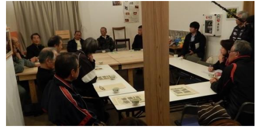
Chairpersons of residents' associations

PWJ also supports the formation of communities by encouraging interaction amongst residents in various events. The Doll Festivals which celebrate the healthy development of female children were held in two temporary housing complexes in March and were partly sponsored by PWJ.