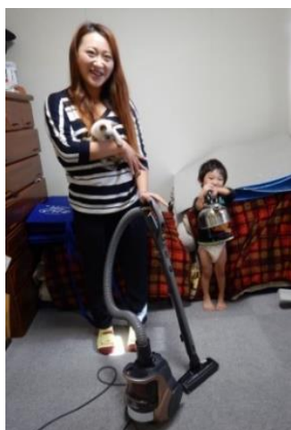
Resident using vacuum cleaner

As the residents of the temporary housing are forced to live an inconvenient life, PWJ donated home electrical appliances to all 1,650 households living in temporary housing units in Mashiki town and Nishihara village. Each family chose one from vacuum cleaner, television, air cleaner and electric carpet for which there was a strong need according to PWJ's own research. Furthermore, PWJ installed 38 outdoor security lights in 7 temporary housing complexes to ensure residents' safety, as there was a growing demand for sufficient lighting at night.