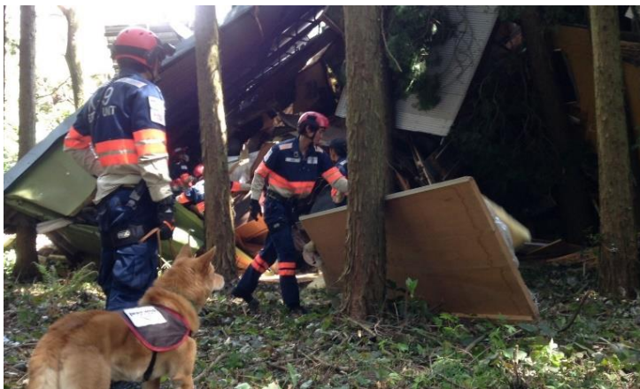
Search and rescue operation

Immediately after powerful earthquakes struck Kumamoto in April 2016, PWJ dispatched its rescue team and search-and-rescue dogs to save victims. They searched for missing people in the stricken areas of Mashiki town and Minamiaso village in collaboration with firefighters, police, and Ground Self-Defense Force personnel.