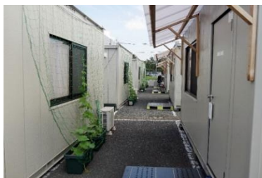
Unit house camp