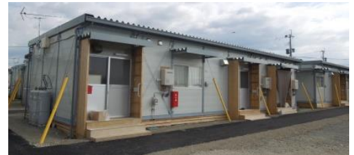
Temporary housing units in Mashiki town