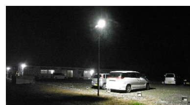
Security light installed in the temporary housing complex